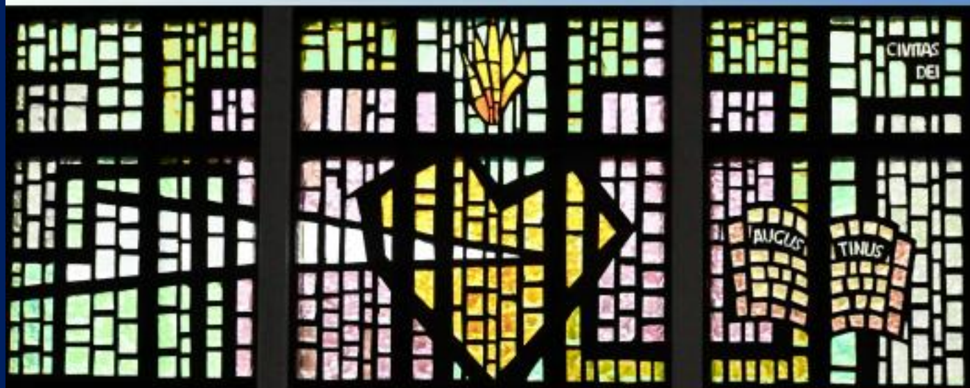
Photograph of the Window of St Rita's Chapel, Honiton by Tanya Trevelin

CARITAS DIOCESE OF PLYMOUTH INVITES YOU TO