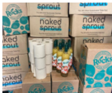
Generous donations from two local businesses - Rocks & Naked Sprout