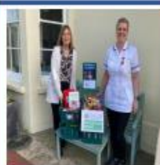
Staff from the Old Vicarage Care Home donating a collection of 'winter warmers.'

In February we distributed 205 parcels that fed 481 individuals. This is a 30% drop in demand when compared to January 2024, as many households were able to benefit from the government's recent cost of living payment of £299.