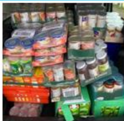
Stock provided by Exmouth Food Bank to support the Pop-Up Pantry in Budleigh