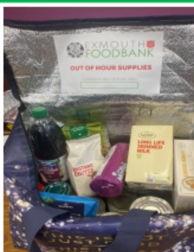
Contents of an out of hours parcel