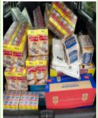
An example of what £300 can buy – cheese, spread, eggs, toothpaste and longlife bread!